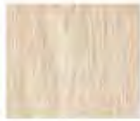
*SIMPSON DESERT ASH