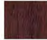
*GIBB RIVER RED