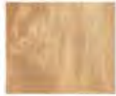
*CRADLE MOUNTAIN ASH